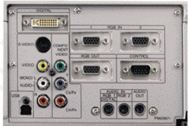
The ImagePro 8941A inputs are easily accessible.

The Dukane ImagePro™ 8941A is the ideal projector for the most demanding, large audience presentations. The eye popping 4500 lumens and XGA resolution provides you rich, detailed images. The optional long throw lens allows you the ability to handle vast distances from the projector to the screen. The 8941A is as versatile as any projector on the market today, so you can feel assured that any and all presentation demands will be easily met by the 8941A. It also has Progressive Scan to give double the video resolution with added sharpness.